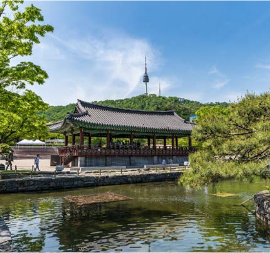
Traditional Village and Seoul Tower