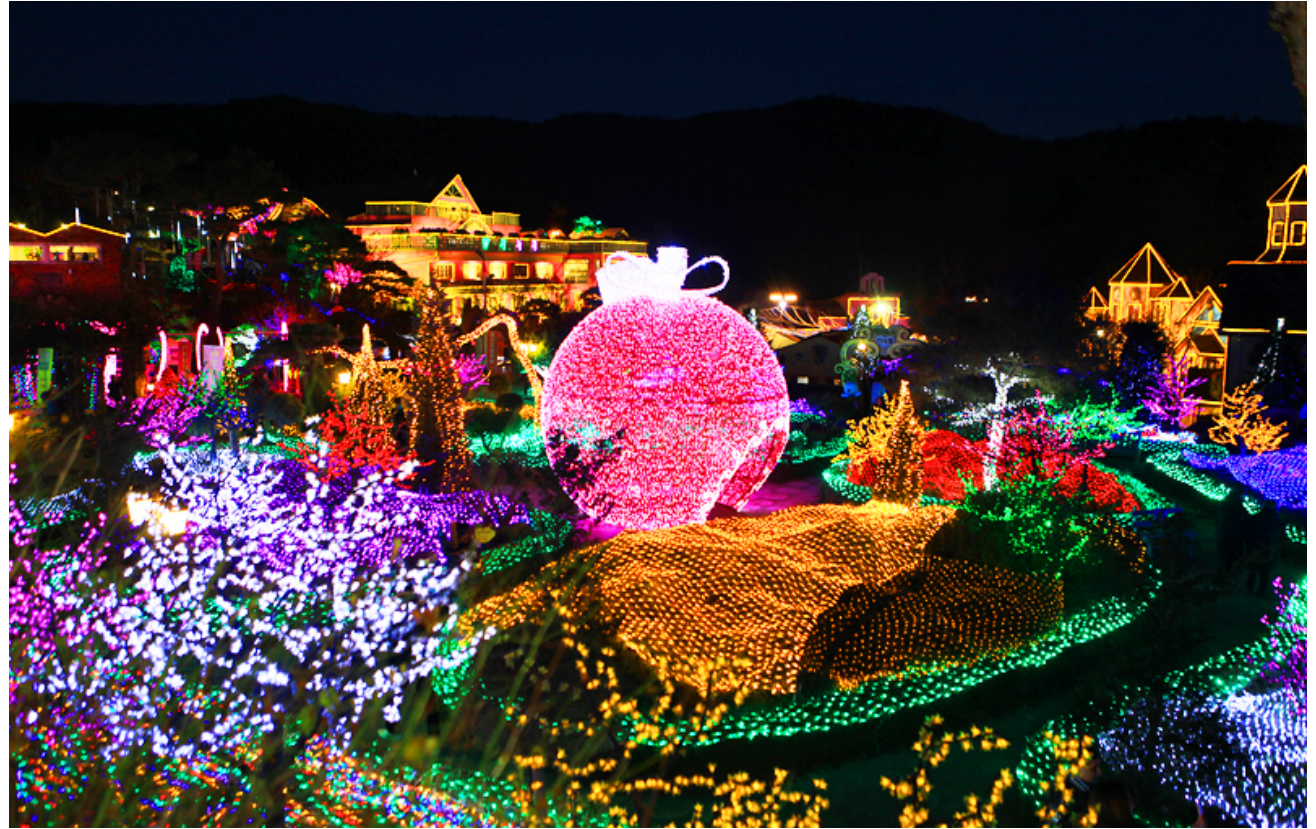
Herb Museum and Park