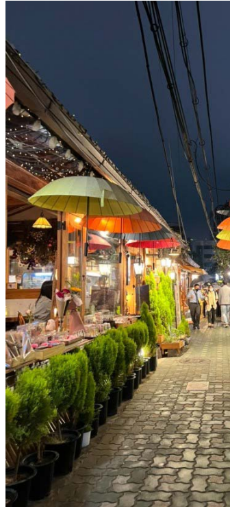
Insa-dong and Iksun-dong